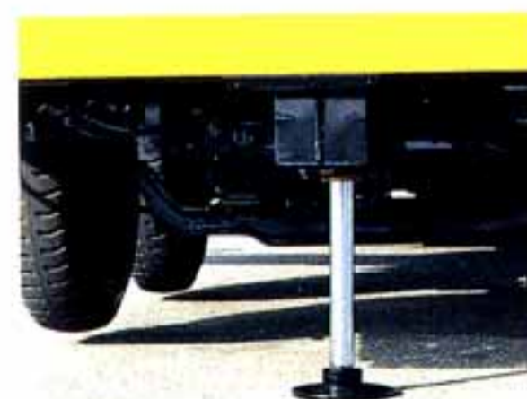
● Hydraulic front jack (option)

● A Hydraulic jack installed under the front extremity of the carrier chassis enables the crane to offer the same lifting performance in all directions. This means that there are fewer limitations caused by the orientation of the crane when it enters a site, boosts its operational range.